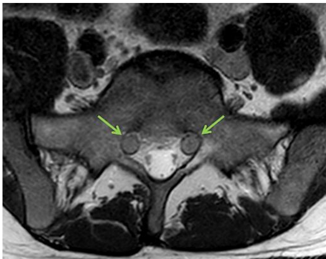
Figure 3 Axial T2-weighted image of the lumbosacral spine demonstrating bilateral, symmetrically thickened S1 nerves (green arrows).