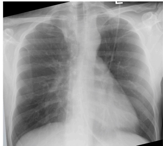
Figure 1 Chest radiograph on admission illustrating a normal cardiomeastinal outline as well as clear lungs and pleural recesses. No radiographic features of COVID-19 are demonstrated.

A lumbar puncture was performed, the results of which revealed a 0.5 mL colourless sample of fluid with an isolated elevated protein level of 1.77 g/L (0.15–0.45). Cerebrospinal fluid (CSF) glucose was 3.9 mmol/L, white cell count <0.001 \times 10^9/L and red blood cell <0.001 \times 10^9/L . In addition, microbiology and culture of the CSF sample yielded no growth of organisms. Oligoclonal band studies illustrated a pattern consistent with a passive transfer of oligoclonal IgG from a systemic inflammatory response and was not indicative of intrathecal synthesis (typically seen in conditions such as multiple sclerosis).